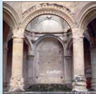
Convent of San Pedro y San Pablo, Teposcolula.

A major silk-raising town in the Mixteca that drew Spaniards and Dominicans, who founded the former Convent of Santo Domingo in the 16th century.