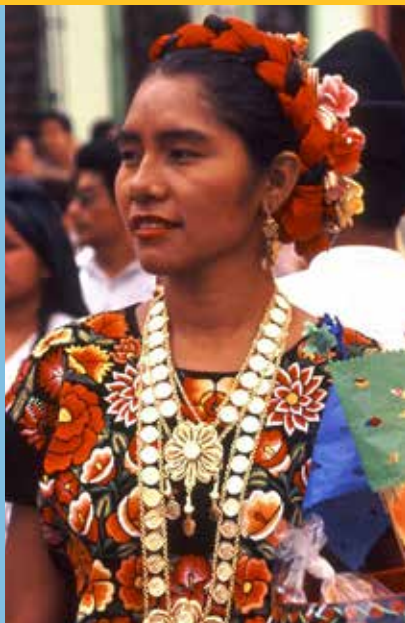
FRONT: FORMER CONVENT OF SANTO DOMINGO DE GUZMÁN.