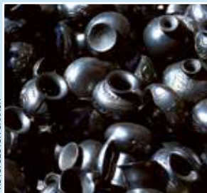
Blackware from San Bartolo Coyotepec.